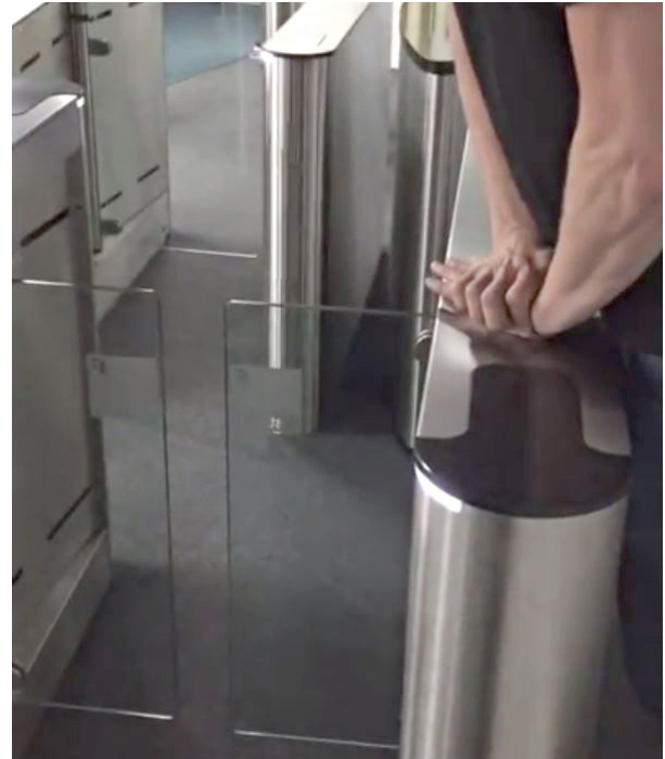
Figure 1: Intense pressure applied to calibrate sensitivity

The Pressure Sensor System consists of an array of Load Sensors and a Load Sensor Control Board (Model#30600), along with the cable assemblies for alarm detection and output. The control board features a sensitivity control to adjust the weight required for detection of a climb-over. Weight detection range is from 33 to 176 lbs. (15 to 80 kgs.).