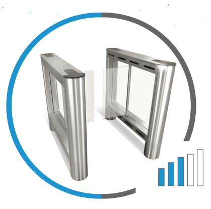
Fastlane Glassgate 150

Our most compact, economic, and popular model offering unsurpassed accuracy and