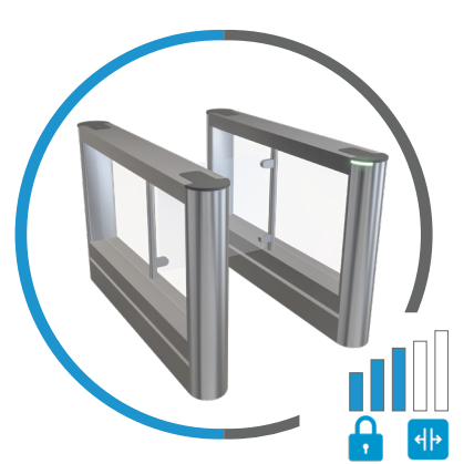
Fastlane Glassgate 155

Our most compact, economic, and popular model offering unsurpassed accuracy and