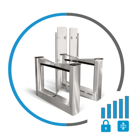
Fastlane Glassgate 400

One of our best-selling products for high security applications. Features a striking t-shaped design and four barrier-height options.