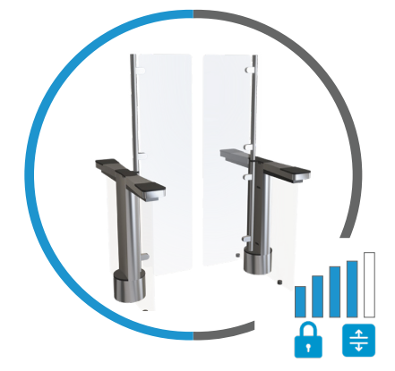
Fastlane Glassgate 300

Bi-directional dual-glass barriers, metal side panels, and extra space to accommodate a host of third-party technology integrations.