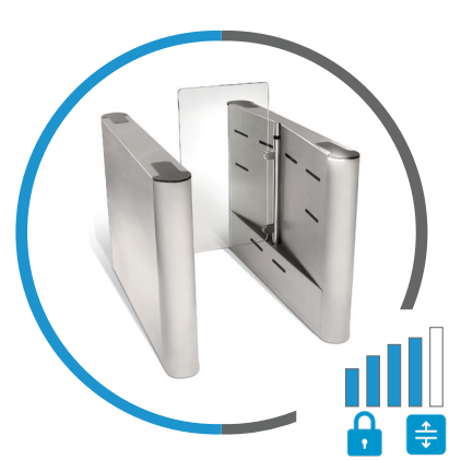
Fastlane Glassgate 200

Offers lane widths up to 47" and features new sidegating technology for side-by-side collusion detection.