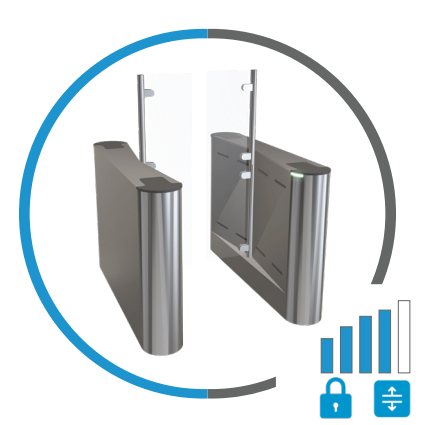
Fastlane Glassgate 200 Plus

The original speedgate is perfect for facilities with limited floor space featuring slim pedestals and a single tall glass barrier.