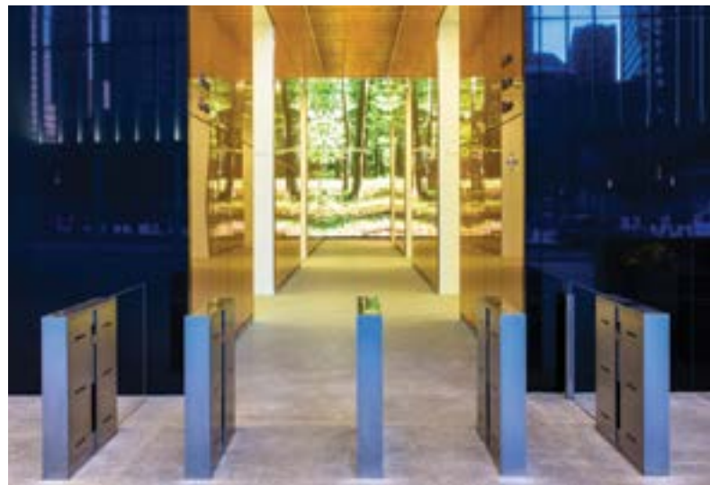
Shown: Fastlane Plus 400 MA with customized square pedestals and internally mounted Schindler lift displays