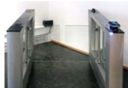
Shown (left to right): Fastlane Glassgate 200 with decorative glass accent; Fastlane Plus 400 MA with custom glass top; Fastlane Glassgate 155 with integrated MorphoWave™ reader and camera