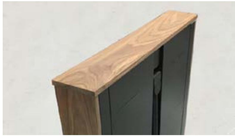
Shown: Fastlane Plus 400 MA with custom wood finish

Extend design beyond color and materials. Fastlane turnstile pedestals can also be customized to enhance the look and feel of your lobby even further. Pedestals can be created longer, wider, taller or in different shapes depending upon your architectural requirements.