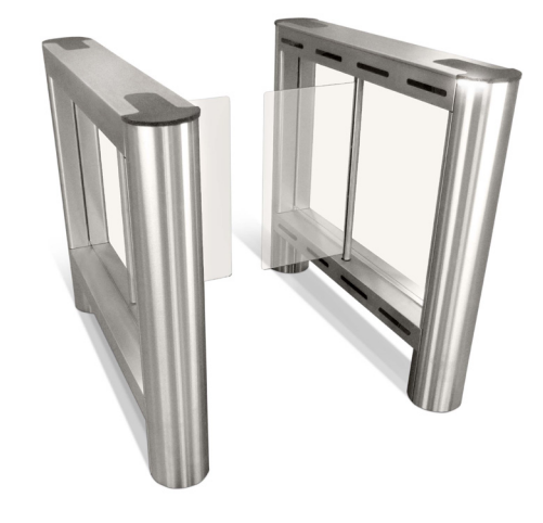
Fastlane turnstiles secure many of the world's most iconic buildings and are designed with cutting edge technology.

Smarter Security is a registered trademark of Smarter Security, Inc.