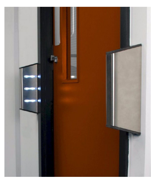
Door Detectives provide entrance control and tailgate detection.

And these new sensors at every entry point will improve security throughout the facility, without any direct costs to the security budget. In addition to the substantial employee safety and risk avoidance benefits, the return on investment for this type of installation, due to Building Automation operations savings, will typically pay for the cost of the turnstile and Door Detective in less than a year.