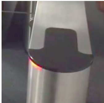
Figure 2: Flashing light indicates alarm has been triggered

Manufactured by Integrated Design Limited. Fastlane is a registered trademark of IDL, 1995.