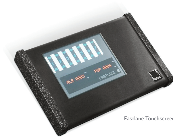
Fastlane Touchscreen Remote