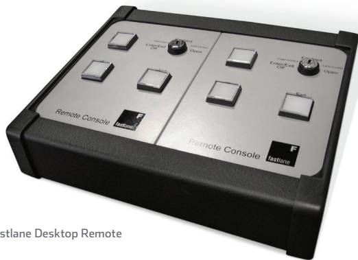
Fastlane Desktop Remote

Desktop and Touchscreen models are designed to provide maximum operational flexibility for Fastlane turnstiles. They are mounted at the security desk and offer full lane control, access control, and alarm monitoring for each lane. These systems work with all Fastlane optical turnstiles.